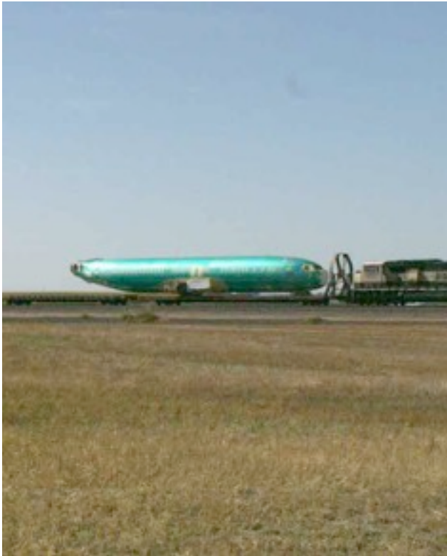
Boeing fuselage on a flat car in Wyoming. Fuselages are shipped from plant in Wichita, KS to factory in Washington